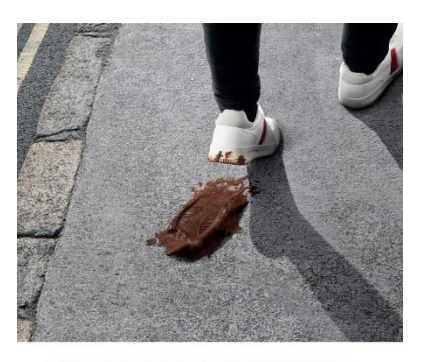
DEAL WITH YOUR DOG'S WASTE SO NO ONE

IT'S EVERYBODY'S BUSINESS DOG POO: BAG IT & BIN IT